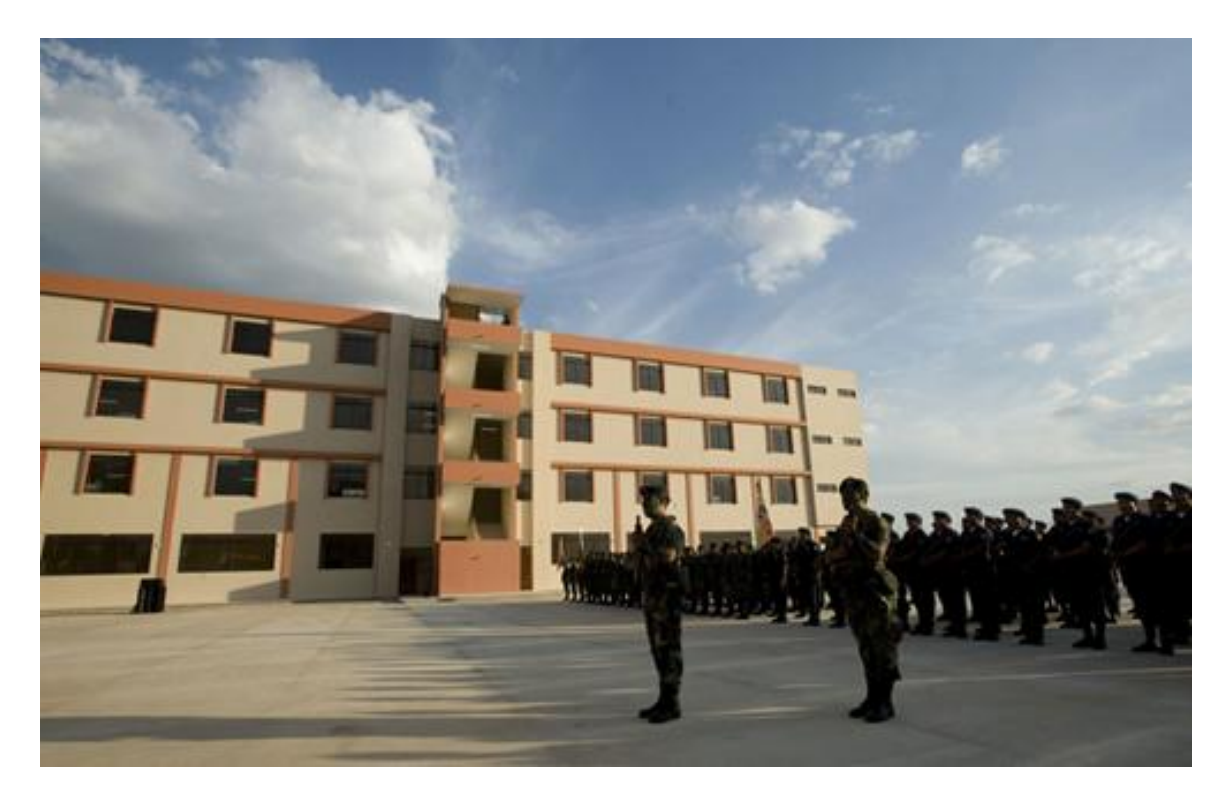
Figure 1: ALBA School, Warnes, Santa Cruz, Bolivia

Iran's interest in the project, which it supports financially, was made clear when Iranian defense minister Ahmad Vahidi arrived in Bolivia for the school's inauguration, despite having an Interpol Red Notice issued for his arrest as a result of his alleged participation in the 1994 AMIA bombing in Buenos Aires. His public appearance at a military ceremony the day before the school's inauguration set off an international scandal and sharp protests from Argentina, which had asked Interpol to emit the Red Notice. Vahidi quietly slipped out of Bolivia. 19