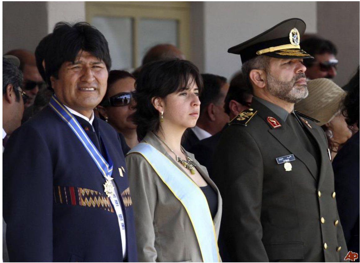
Figure 2: Figure 3: Bolivian President Evo Morales and Iranian defense minister Ahmad Vahidi at a military ceremony in Santa Cruz, Bolivia

alliances among Mexican gangs such as the Barrio Azteca and the Central American gangs such as the MS-13 along with the expanding reach of Los Zetas in the human smuggling business all auger ill for border security.